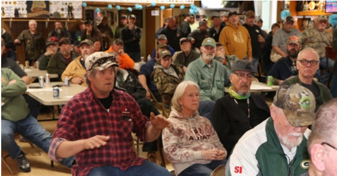
These events are important as we continue our work for you as the United Voice of the Wisconsin Hunter